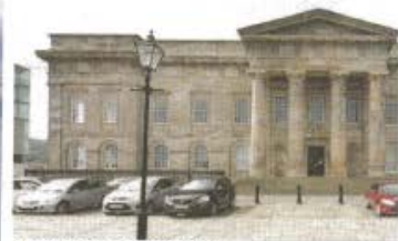
Custom House, Greenock