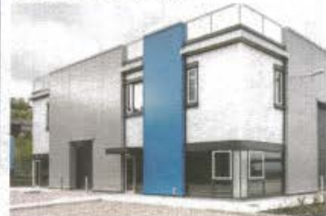
Kelburn Business Park, Port Glasgow